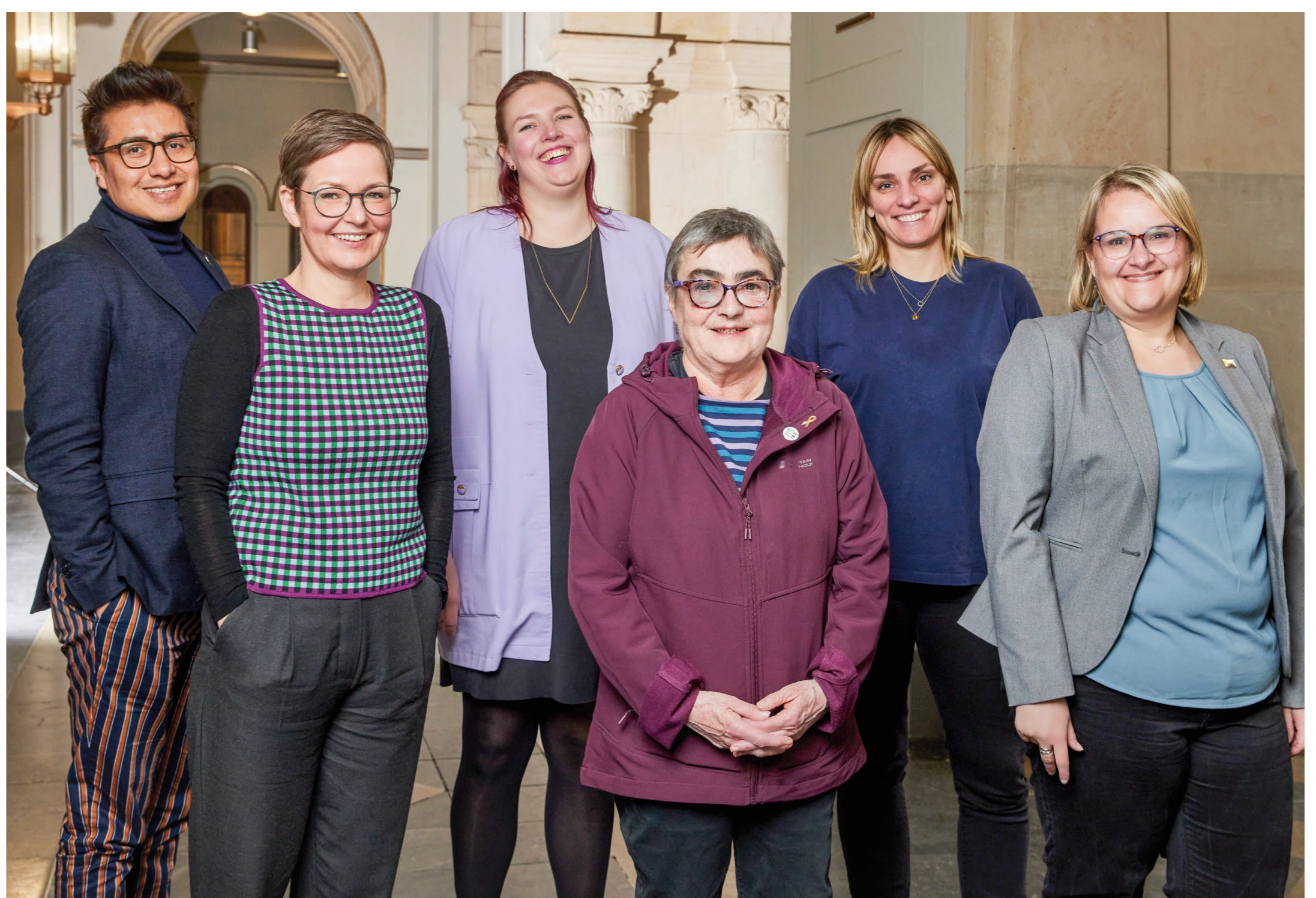
The board Rainbow Cities Network

One of the hallmarks of our network is the dedication of our member cities to actively engage in advancing LGBTIQ+ rights and inclusion. Through collective efforts, we have not only created rainbow cities within our countries but also extended our influence to produce policy recommendations for other local governments. We are immensely grateful for the support extended to us by the European Commission, which has enabled us to amplify our impact and reach new heights in advocating for equality and justice.